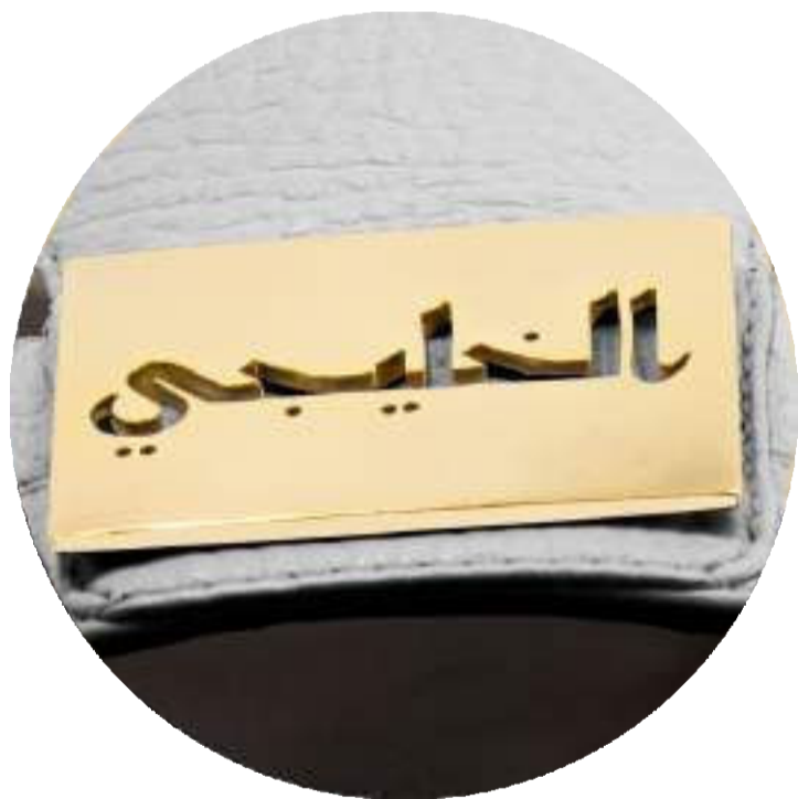
Gold plated plate.