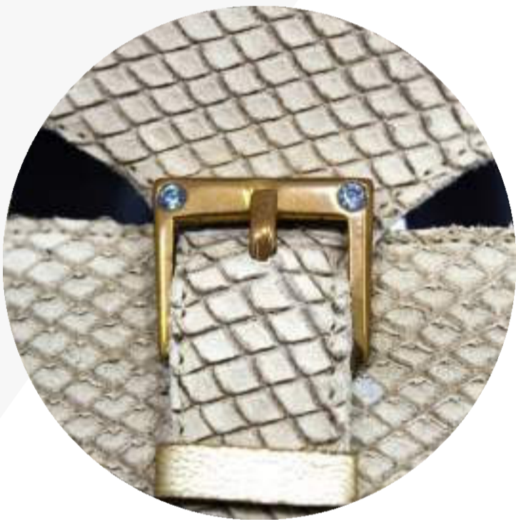
Gold plated buckle with zircons details.