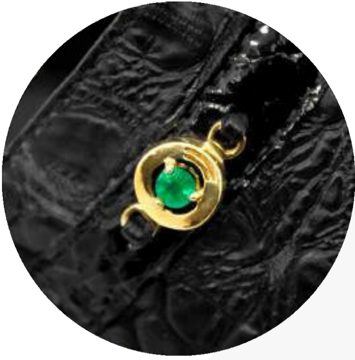
18k gold pendant with emerald jewel.